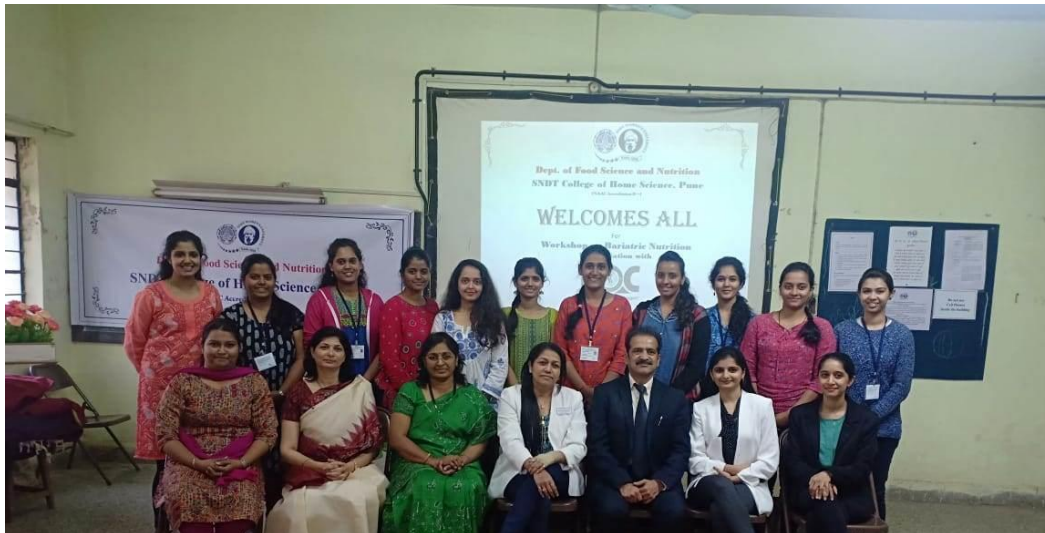
Workshop on Bariatric Nutrition-January 19,2019

32. Name of the Activity: National Conference on Nuances of higher Education, sponsored by ICCSR.