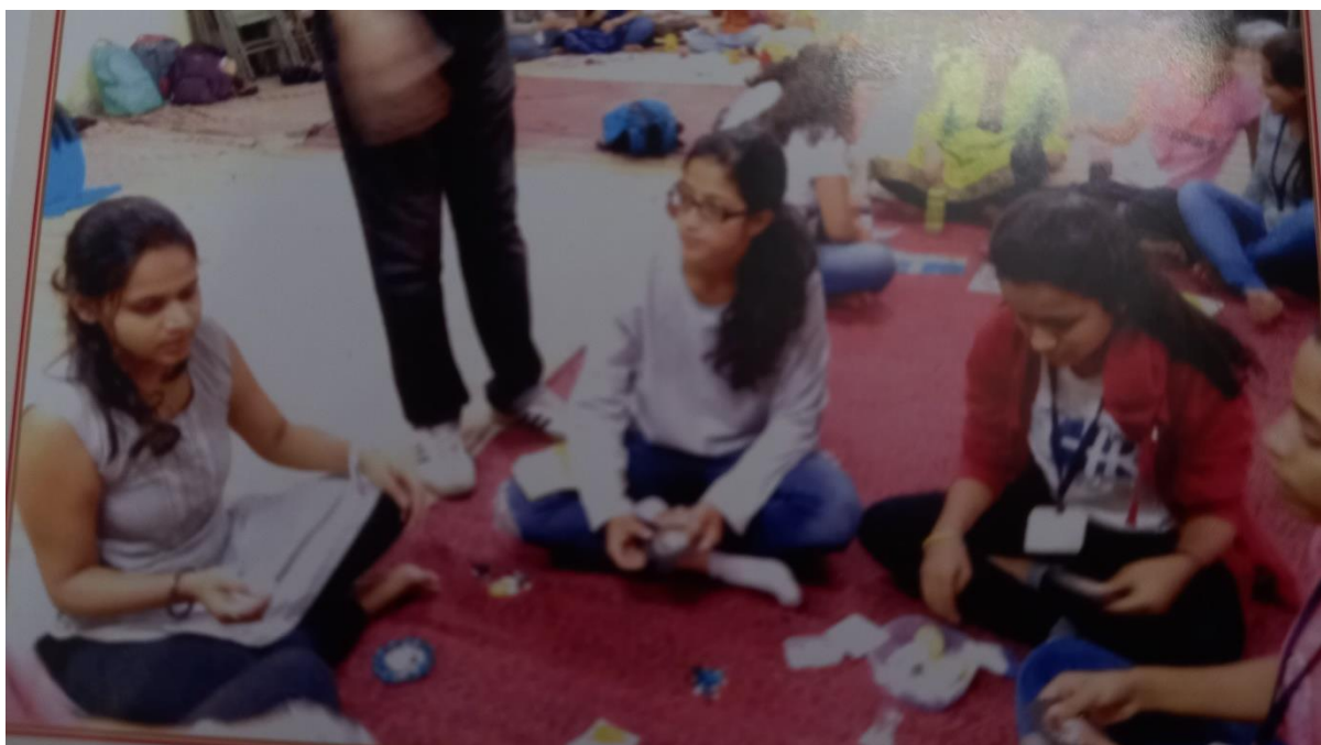
Skill Development Activities(Diya making ) for S.Y.HECS from June 2016 to January,2017

Resource person: Dr.Lalieetaa Bbhagat and department teachers.